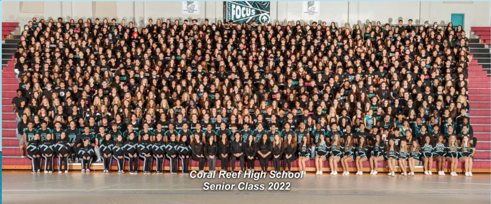
Coral Reef High School Senior Class 2022